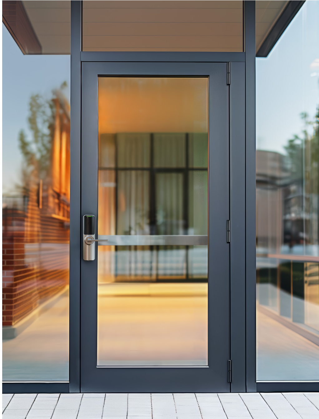
*Shown in satin chrome with latitude lever