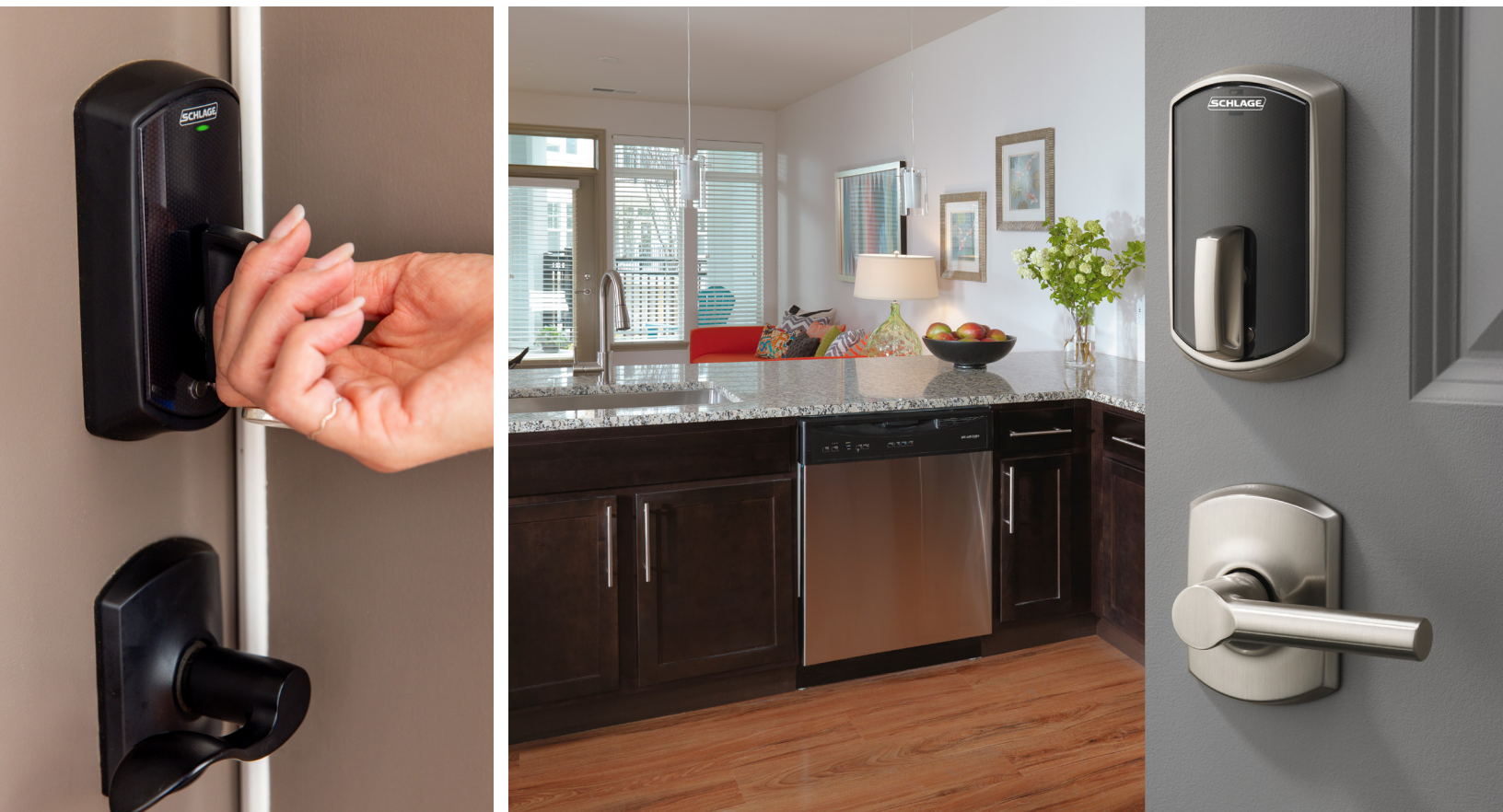
Featured products: Schlage Control® Mobile Enabled Smart Lock (Greenwich trim, matte black finish and accent lever (L); satin nickel finish and Broadway lever (R))