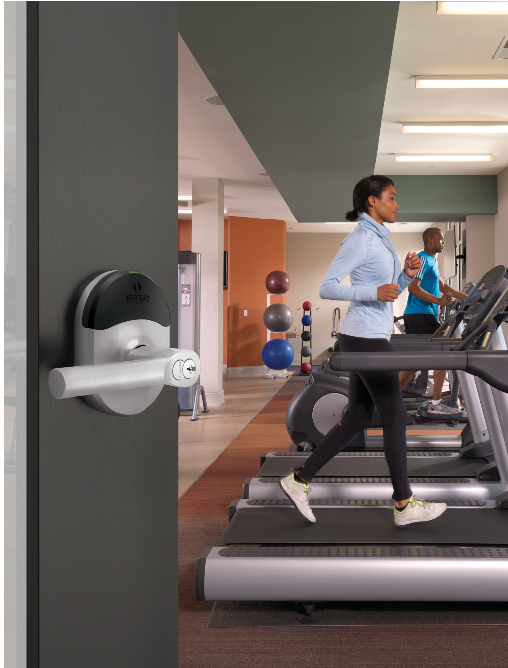
*Shown in satin chrome with broadway lever