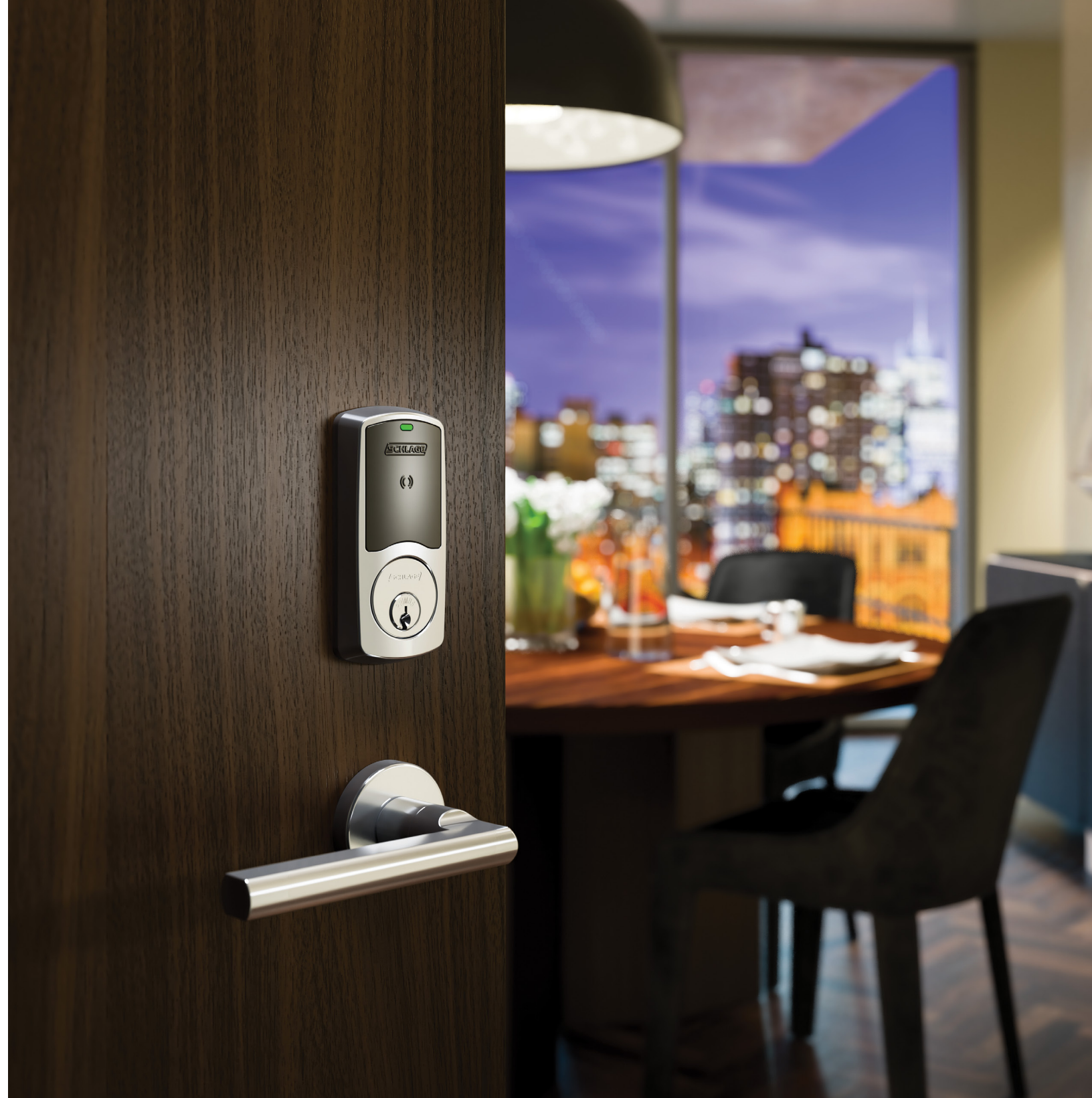
Featured product: LE mobile enabled wireless lock (satin chrome finish, latitude lever)

Contact us at 888-868-8709 to get connected with an Allegion sales consultant in your area. Additional multifamily resources and tools are available at us.allegion.com/multifamily .