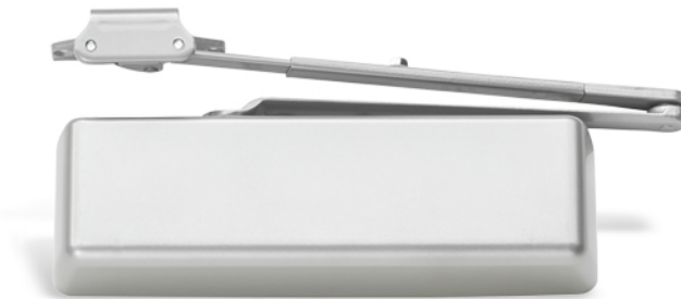
Figure 1: LCN 4040XP Door Closer

The LCA for this EPD is based on LCN 4040XP. The LCN 4040XP and 4040XPT Series Door Closers environmental impacts are within \pm 10\% of each other. This EPD is representative of manufacturing in the US.