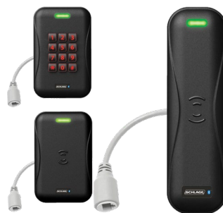
Figure 1: Schlage Reader Controllers Series RC11 (right), RC15 (bottom left), RCK15 (top left)

The reader controllers is manufactured in a black finish and come in three different form factors, RC11, RC15, and RCK15. The RC11 is designed for mounting on a mullion or where a junction box is not available. The RC15 is designed to be mounted on a single gang junction box as is the RCK15 with the difference being that the latter also included a keypad as part of the design and functionality of the reader.