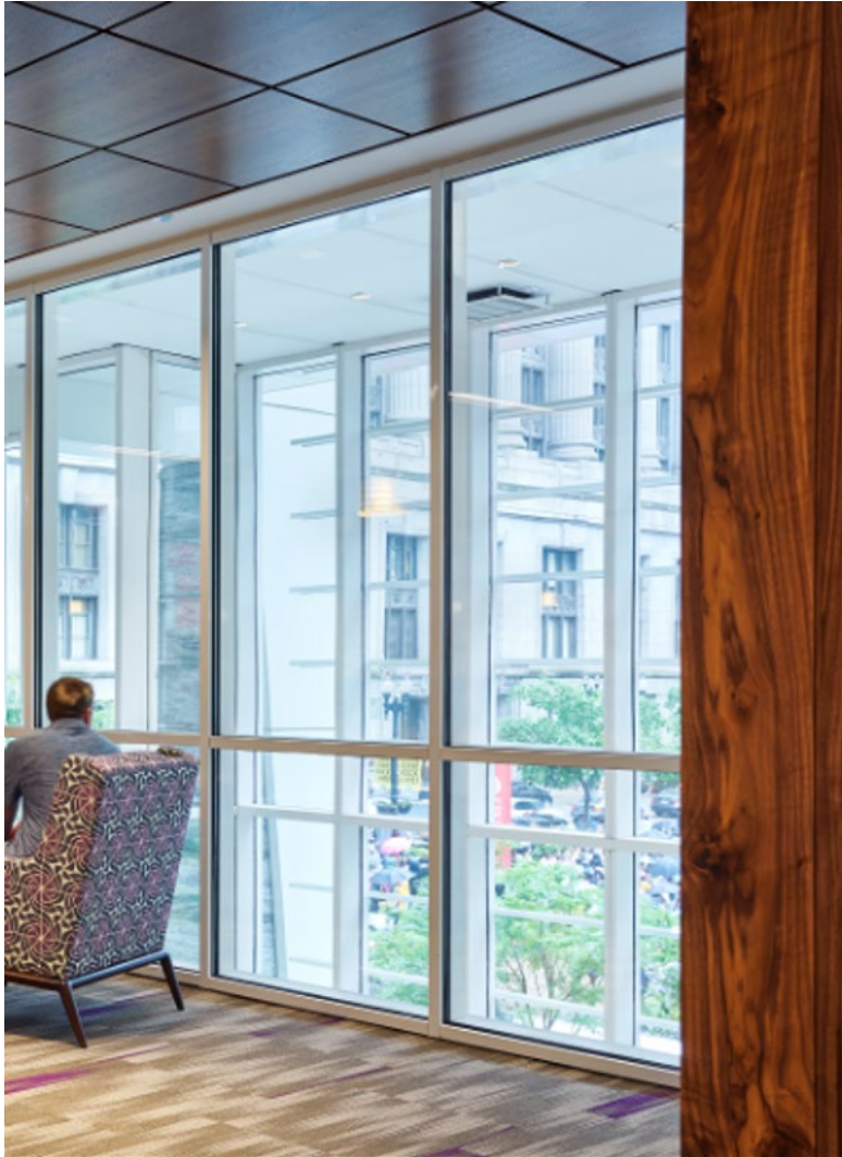
Fireframes® Curtainwall Series Fire-rated Frames

This EPD was created using a UL-verified EPD generator for Allegion's full product portfolio. For additional product specific EPDs, please contact Allegion at sustainability@allegion.com .