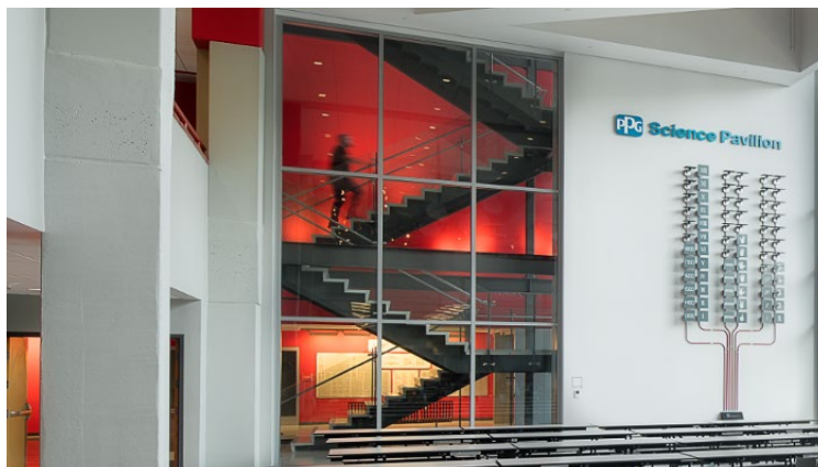
Figure 1: Fireframes® Curtainwall Series Frame

Note that all tables throughout this report for Pilkington Pyrostop® monolithic glass 60-201, including results, also represent 60-201 TI, 60-201 BR L1, 60-201 TI BR L1. All tables throughout this report for Pilkington Pyrostop® monolithic glass 120-202, including results, also represent 60-500 and 90-102. The impacts for the products listed above are within the \pm 10\% threshold of the impacts of the representative product modeled for the EPD.