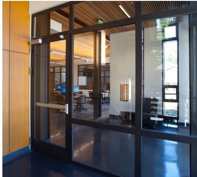
Figure 1: Fireframes® Designer Series Door and Frame and TGProtect™ FR System

According to ISO 14025, EN 15804 and ISO 21930:2017