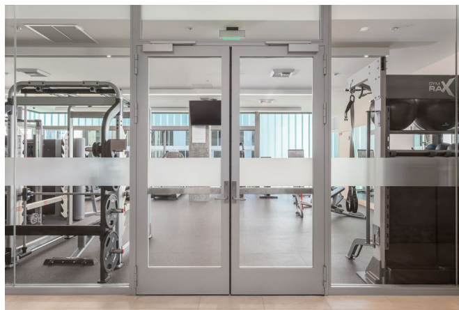
Figure 1: Fireframes® Heat Barrier Series

This EPD covers Fireframes® Heat Barrier Series doors and frames combined with Pilkington Pyrostop® monolithic glass with the following glass configurations: 60-101, 60-201, 90-102, 120-60, 120-108, and 120-202.