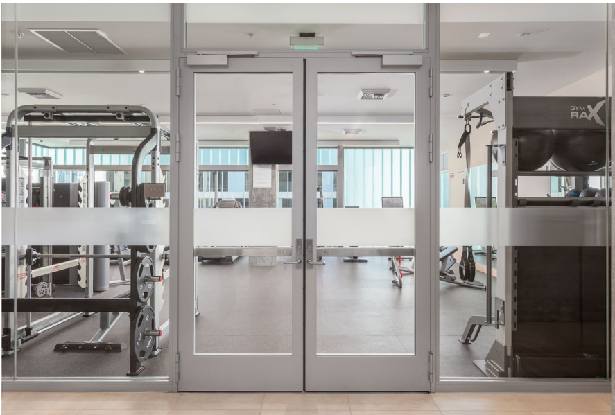
Fireframes ® Heat Barrier Series

This EPD was created using a UL-verified EPD generator for Allegion's full product portfolio. For additional product specific EPDs, please contact Allegion at sustainability@allegion.com .