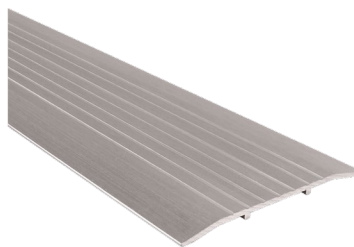
Figure 1: Zero Thresholds

The products exceed ANSI/BHMA A156.22 Grade 1 standards for both cycle testing and force testing requirements, ensuring superior performance in heavy-duty applications. Zero thresholds are manufactured by Allegion and represent the company's commitment to quality door sealing solutions.